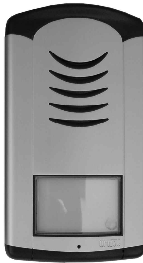
Single button no camera