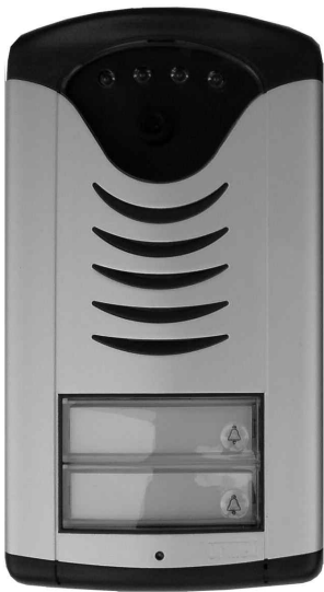
Twin button with camera

The ProTalk IP Door Entry Systems are based around a slimline SIP door phone which registers as an extension to any SIP based phone system. Callers at your door can talk to you whether you are on site or not. The camera option shows real-time video on either a computer or Snom 800 series SIP telephone. ProTalk also offers a range of supporting kits to implement or enhance full door entry control including magnetic locks, battery backups or keyfob entry.